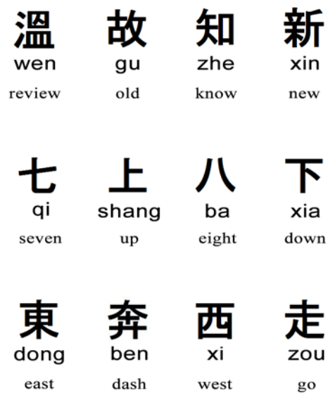
Figure 5. Chengyu involving isocolon and antithesis

The basic scheme of aural symmetry is isocolon, the proximal deployment of parallel grammatical structures, frequently with the same number of words; in exceptionally tight parallelism, with the same number of syllables. Figure 4 includes a selection of chengyu that involve the figure isocolon using the pattern of A-B // A-B, where A is one part of speech, B another. Isocolon is especially effective with the solecistic style of chengyu , because its symmetrical character can "[tie] together features that can otherwise seem diffuse" (Loy and Elklundh 2006: 508). Antithesis (a trope), as in Figure 5, often reinforces isocolon in chengyu , while asserting a contrast.