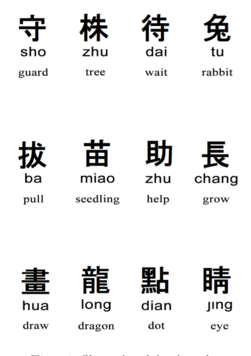
Figure 4. Chengyu involving isocolon

such stimuli (Wageman 1997). Chengyu operate in the visual mode when deployed in writing, of course, but Winkielman et al.'s findings extrapolate to aural perception very naturally as well, so those findings are also explanatory for chengyu used in speech.