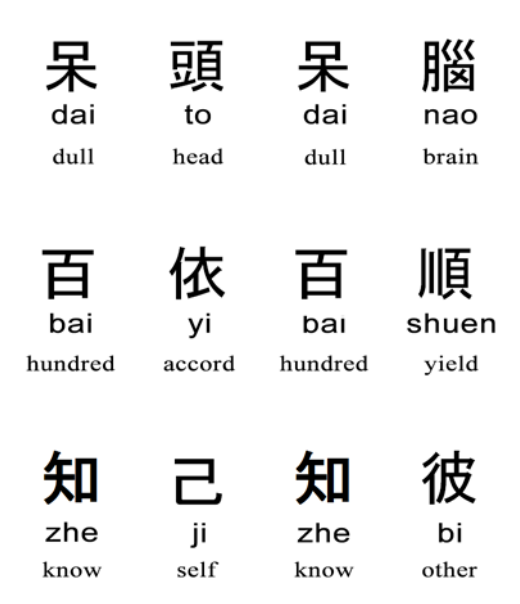
Figure 7. Chengyu involving ploche and tmesis or antithesis

And, of course, there is a more immediate way in which repetition of the signifiers has cognitive effects. Visually, the repetition of characters increases