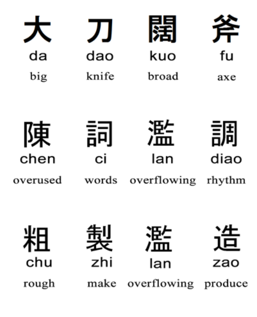
Figure 6. Chengyu involving synonymia