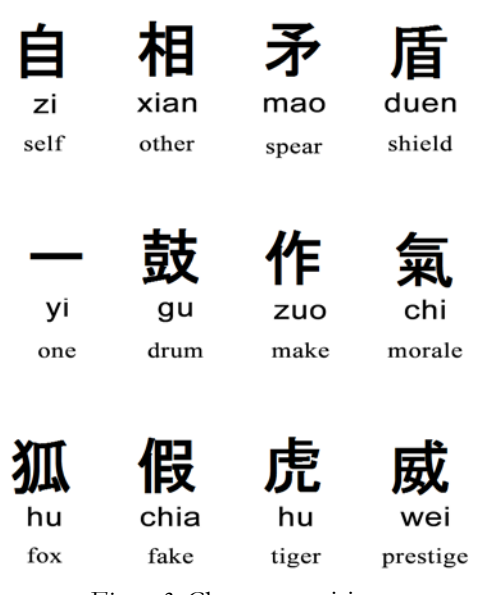
Figure 3. Character pairing

things that conflict with each other. The characters "self other" are one semantically related set, "spear shield" the other. In the case of "one drum make morale," describing a need to perform an entire act without a break, "drum" is modified by "one" in the first pair, while "make morale" is a predicate comprising the second. In the case of "fox fake tiger prestige," describing someone who uses other people's power to gain benefits, "fake" is the action the "fox" makes, while the "prestige" is the possession of the "tiger." This balance gives chengyu much of their aesthetic power.